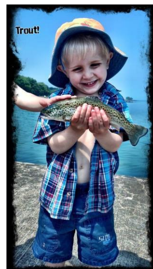
Winner of the Free Fishing Day – Largest Fish!

Next meeting: Wednesday@ July 10th 7:00 (Executive Board and Trustees meet at 6:30)